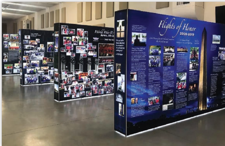
"The Flights of Honor" display at the Ballroom in September was an awesome example of Howells groups working together!

All kinds of projects arose from the informal discussion. Most ideas are based not only to draw young families to return to make Howells their home but also to keep the older generations happy to retire here, too. Economic development will play a key role. A welcome committee was formed.