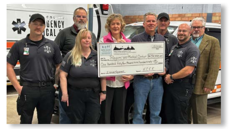
KCFF check presentation

Keith County Foundation Fund presented a check for $154,990 to Keith County and the City of Ogallala for the