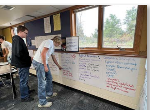
Follow-Up to the KCFF Keith County Youth Survey, Oct. 2023

Our greatest asset is our people. These young people represent our future. We want to hear