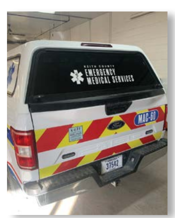
Keith County Emergency Medical Service vehicle with KCFF logo

Keith County Foundation Fund presented a check for $154,990 to Keith County and the City of Ogallala for the