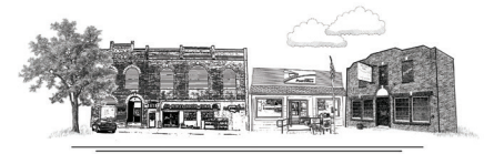
CROFTON COMMUNITY FOUNDATION FUND serving the Crofton Area

Our "Builders Club" is making monthly donations through automatic withdrawal. You can also participate in the Builders Club through annual, semi-annual or quarterly donations.