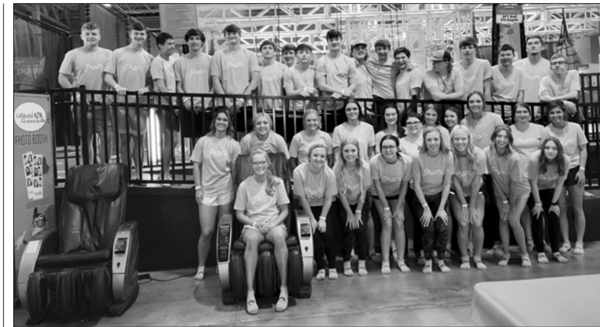
The Diller-Odell Post Prom Committee provided a different type of post prom fun for the Junior and Senior class members and their guests this year. Prom was held on March 26 at the Diller Opera House and followed by hours of games and action at Defy Gravity in Lincoln. The Diller Community Foundation Fund supported the Post Prom Committee as a Platinum Level sponsor to provide an enjoyable, safe and alcohol-free activity for the students.

The Diller Community Foundation Fund and O.A.C.E. Congratulate the 16 graduates of Diller-Odell and wish them well in whatever road they travel. We hope that they will always remember their hometown community and the roots that they have here. We welcome them to live here and build their futures in our community as well. Good Luck and Best Wishes 2022 Graduates!!!