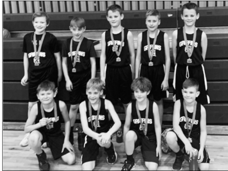
Diller Odell's 3rd and 4th grade basketball team medal at the MIT Tournament in Lincoln, looking sharp in their new uniforms!

Youth from across the area participate heavily in the Diller-Odell Youth Sports program. This year the foundation graciously supported the programs by granting funds to purchase a blocking sled for the youth football program and uniforms for the boys and girls youth basketball programs. The kids are excited to test out the new sled this fall and the basketball teams are looking great in their new apparel.