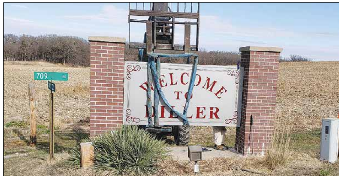
NEW WELCOME SIGNS! The Village of Diller asked for a grant to replace the four existing "Welcome to Diller" signs. The signs located both north and south of town have been an invitation to visit for many years and were starting to show their age. The money granted from the Diller Community Foundation Fund was used to replace the aged signs with heavy duty, weather resistant laser cut metal signs. Installation was completed by village maintenance man Bob Wellsandt and village mayor Glen Behrends.