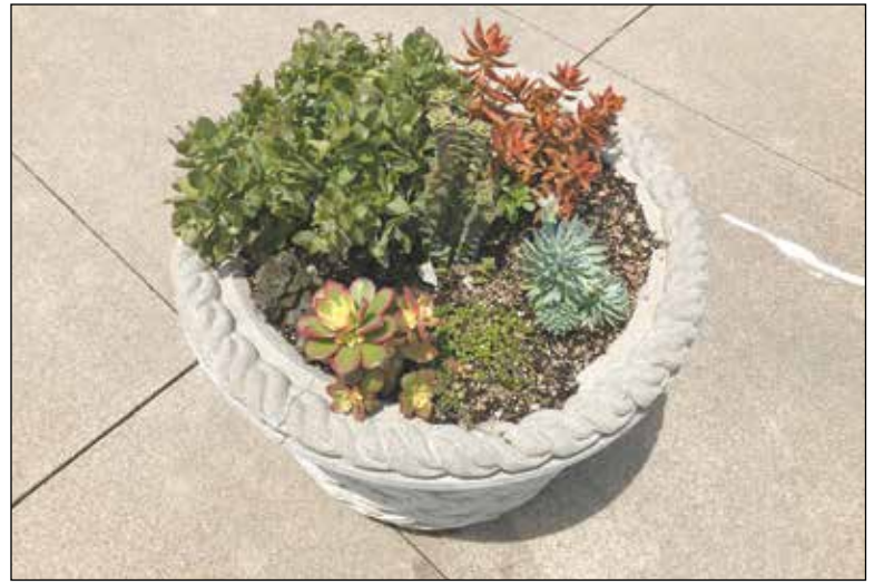
The Happy Harbiners 4-H club planted succulents in the nine large planters along Main Street for all to enjoy.