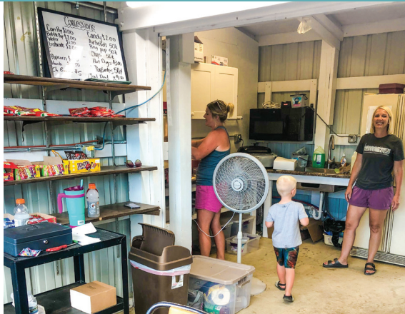
Members of St. John's Lutheran Church use the newly improved concession stand for the Leigh Men's Fastpitch softball tournament.