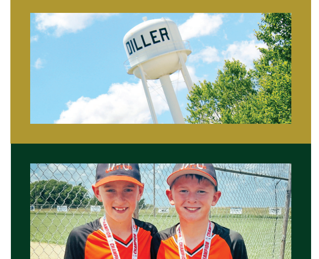
The Future is Bright!