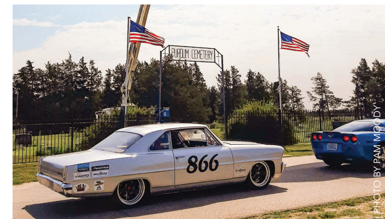
Each August, the Loup 2 Loup Road Race goes from Halsey to Purdum and back. Pictured here is Purdum Cemetery, a past grant recipient.