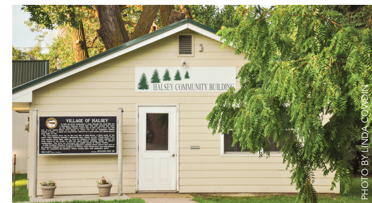
Village of Halsey Community Building

– Dunning Community Hall door replacement