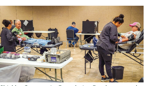
Shickley Community Foundation Fund was proud to sponsor a lifesaving community blood drive.