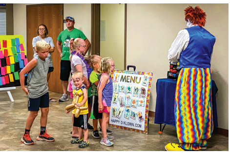
Longhorn Days activities were supported through a Welcoming and Belonging Grant from Nebraska Community Foundation.